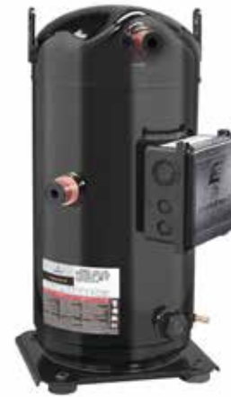
ZP scroll compressor

ZP104, ZP122 and ZP143KCE compressors for light commercial systems have a reduced footprint and weight for more compact systems. Their high efficiency helps to reduce operating costs.